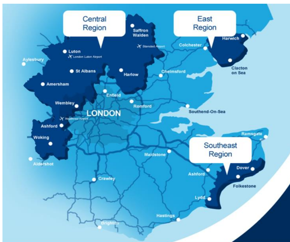
Figure 2: The three charging regions

As noted above, our volumetric charges differ according to the region in which the NAV appointment is located. We operate 3 charging regions the boundaries of which are shown in the diagram below, along with the volumetric rates applicable in each region.