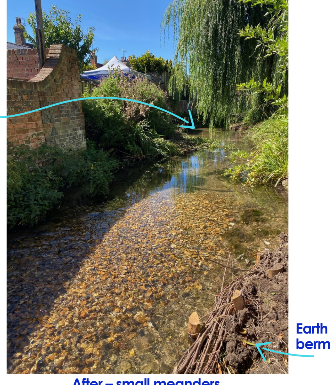
After – small meanders