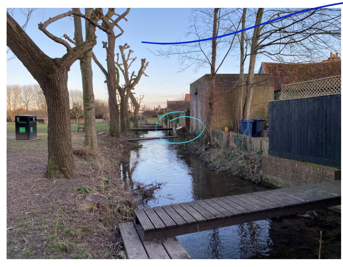
Feb 2023 – Willow Pollarding (& tree removal)