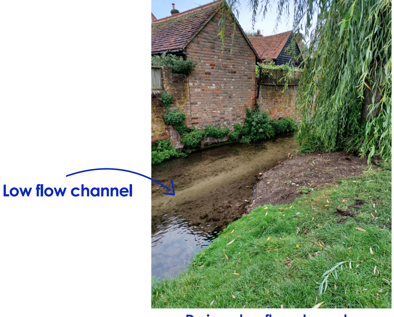
During – low flow channel