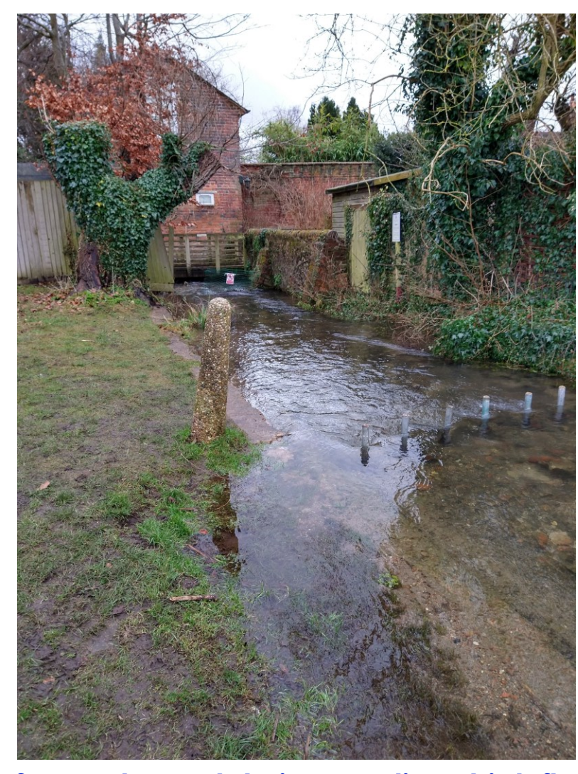
Before - channel during medium-high flows