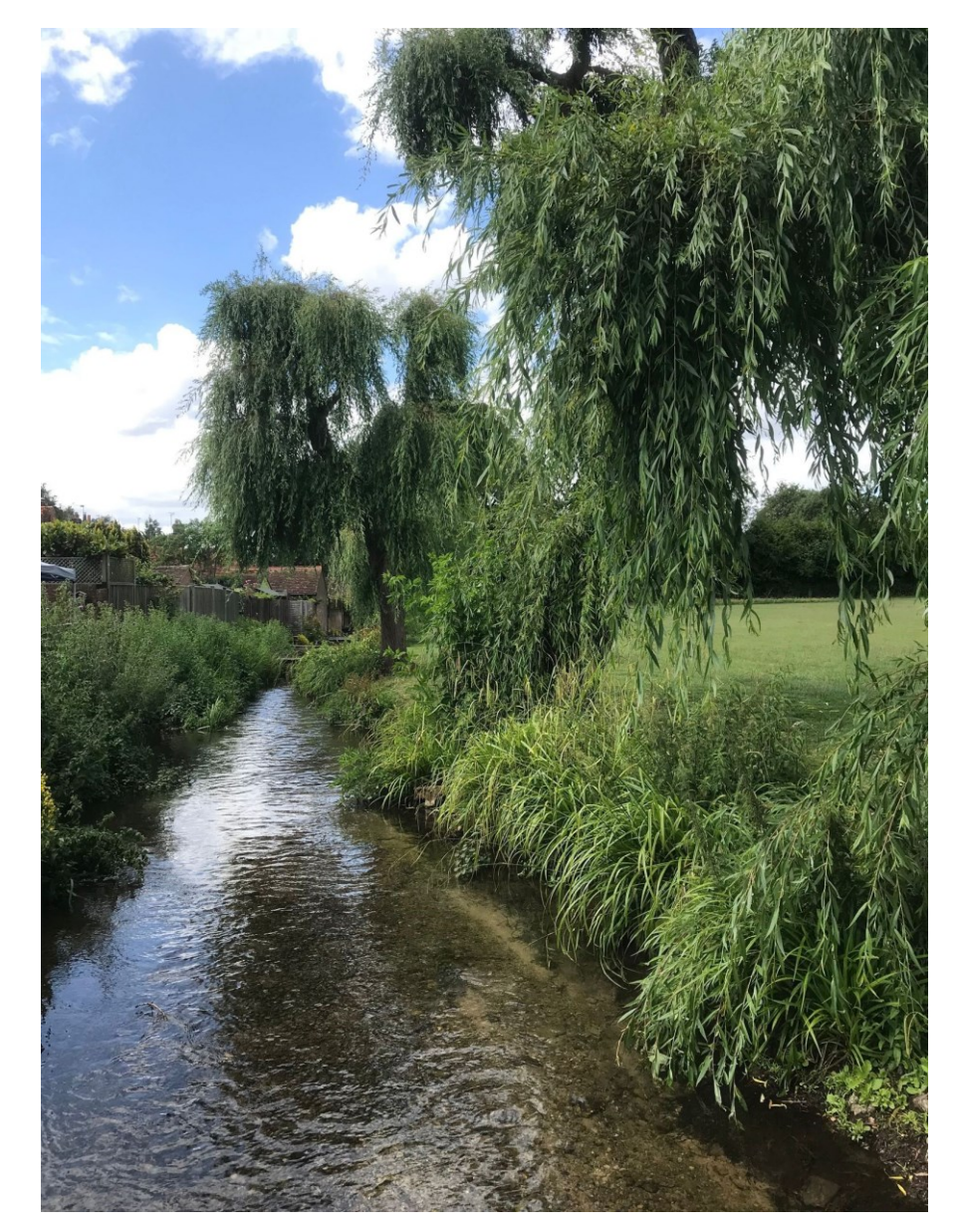
Before – straight silted channel