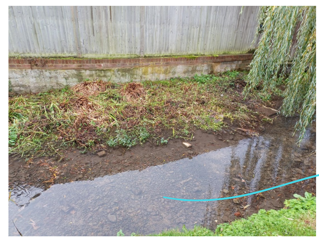
Before – heavy silt deposition caused by low flows