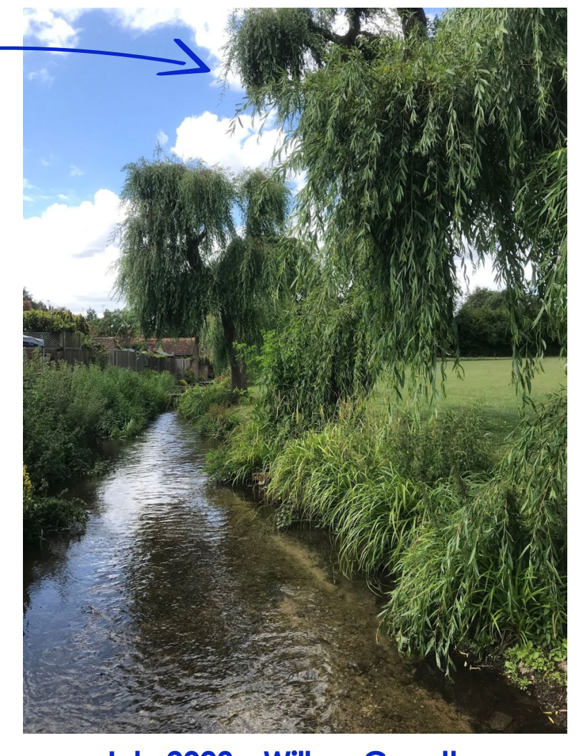
July 2023 – Willow Growth